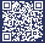
RUTXR1 360° VIEW

ENTERPRISE RACK-MOUNTABLE SFP/LTE ROUTER