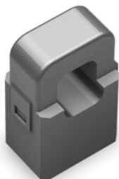
ZEM-61-300-2m 300A, 24mm