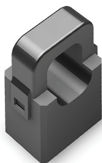
ZEM-61-600-2m 600A, 36mm