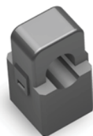
ZEM-61-120-2m 120A, 16mm