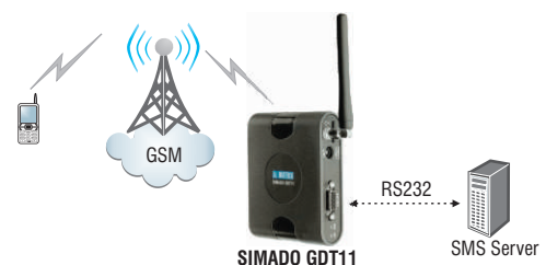
SIMADO GDT11 in SMS Applications

SMS (Short Message Services) is very popular and cheapest communication tool in GSM network. The SIMADO GDT11 can be used for sending and receiving SMS for varied application like order booking, sales promotional activities, logistic, re-filling of vending machines, FMCG Supply, Ticket bookings, AMR (Automated Meter Reading) and other remote devices which can be controlled by SMS.