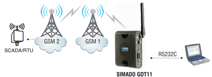
SIMADO GDT11 in Data Acquisition Application

Matrix SIMADO GDT11 can be deploy for online data, acquisition SCADA, Remote login, monitoring and controlling devices. Remotely working device data like level, temperature, pressure, flow, density etc., can be captured in real time using SIMADO GDT11.