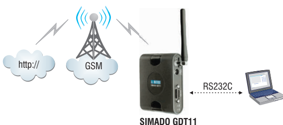
SIMADO GDT11 for GPRS (Internet) Application

Where traditional internet services are not available, GSM network can be used for browsing the internet by using Matrix SIMADO GDT11. Internet connection can be established in no time by connecting computer with COM (RS232C) port provided on SIMADO GDT11. User can surf the internet seamlessly like leased line, if GPRS services is activated from GSM service provider.