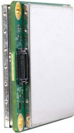
XDL Micro Compact and Easy to Integrate