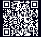
RUTM51 360° VIEW

The RUTM51 is a budget-friendly dual-SIM, multi-network industrial 5G router delivering connectivity for data-heavy applications. With five Gigabit Ethernet ports, dual-band Wi-Fi, and auto-failover, it ensures seamless, reliable performance. Backward compatibility with 4G Cat 12 and a versatile range of interfaces make the RUTM51 5G router a smart, future-proof choice for businesses seeking high-speed connectivity at a lower cost.