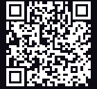
RUT200 360° VIEW