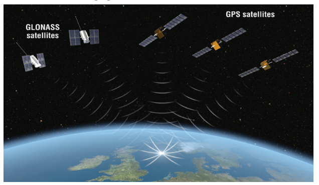
Use of both the American GPS and Russian GLONASS Navigation Satellite Systems