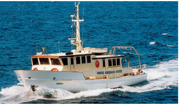
High accuracy in three dimensions for Hydrographic Survey

Marinestar® GNSS is an integrated DGPS/DGLONASS, decimetre level, phase based, service using satellite 'orbit and clock' data valid worldwide, based upon GPS and GLONASS L1 and L2 frequencies. The Marinestar® GNSS Service provides a high availability, high integrity, global solution to a horizontal accuracy of 10 cm (95%) and vertical accuracy of 15 cm (95%).