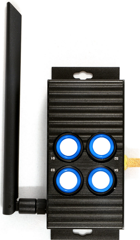
Hardware Version HW 107

Temperature, Relative Humidity, Volatile organic compounds (VOC), Particulate matter PM1, PM2.5, PM10, Ozone O 3 , Carbon Monoxide CO, Nitrogen Dioxide NO 2 , Sulphur Dioxide SO 2 , Noise level