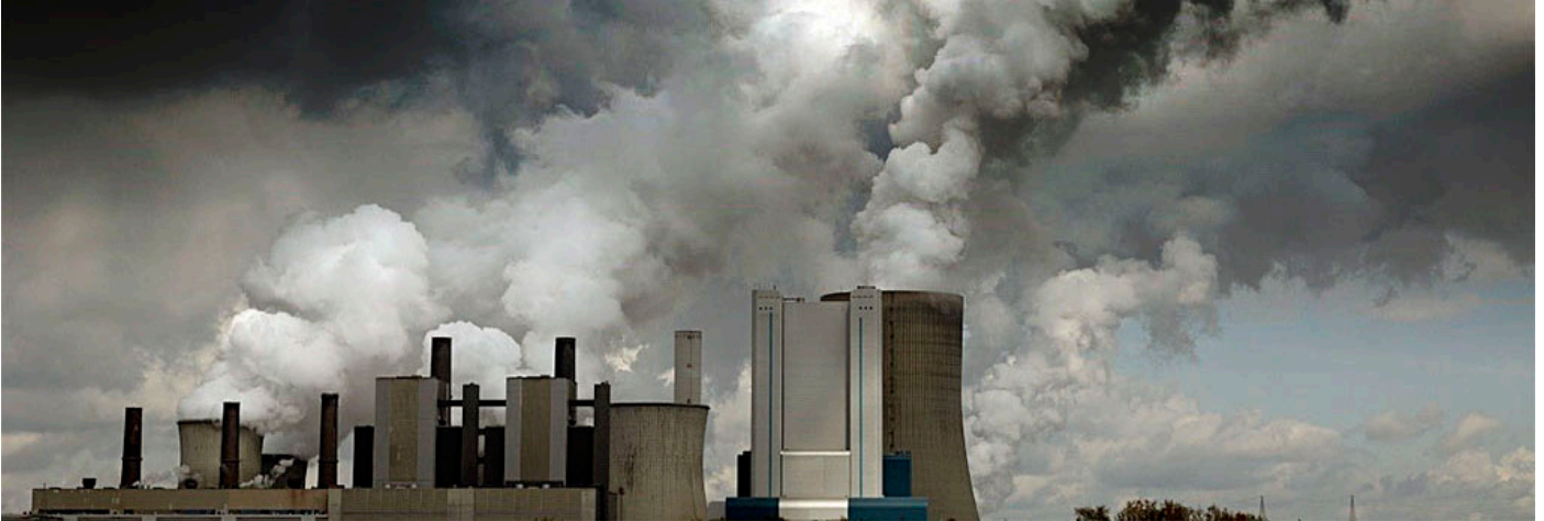
Picture: Air pollution can shorten our lifespan, this is why we need uRADMonitor

The purpose of the model D detector and that of the entire uRADMonitor network is to monitor chemical and physical factors that can have a negative impact on our health or on the environment. Using its advanced sensors, the model D monitors against the following potentially hazardous parameters: