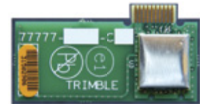
Zelia (approximate size)

With this antenna design, Zelia can be installed either perpendicular to the ground plane or off the edge of the PCB, which means an even smaller footprint on the PCB.