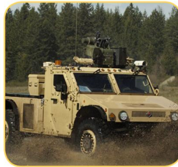
Unmanned Vehicle Control

The VG440 combines highly-reliable MEMS gyros and accelerometers with high-speed DSP electronics to provide a fully stabilized vertical gyroscope in a small and rugged environmentally-sealed enclosure. The VG440 provides consistent performance in challenging operating environments and is user-configurable for a wide variety of applications