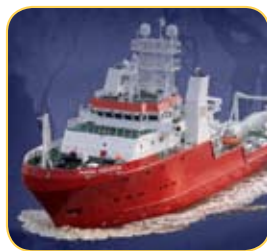
Sea State Monitoring

This rugged low-cost inertial system meets the demanding environmental requirements for operation in a wide variety of land vehicle and marine platform systems, and it is ideally suited for cost-sensitive high-volume OEM applications.