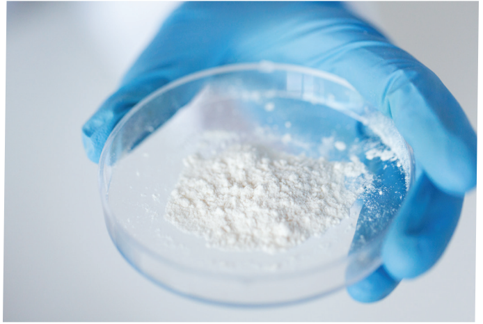
Unlike static, 2D X-ray mail scanners, MailSecur can detect liquids and powders as they move around in a package, as well as many other types of threats that would get past an X-ray scanner.

Using safe millimeter wave technology detects everything that X-ray mail scanners can, and in smaller quantities, and is 300 times more sensitive than X-rays for detecting powders and liquids.