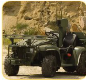
Land Vehicle Guidance

The NAV440 combines highly reliable MEMS sensors, magnetometers, and a WAAS/EGNOS-enabled GPS receiver all in a small and rugged environmentally sealed enclosure. The NAV440 provides consistent performance in challenging operating environments, and is user-configurable for a wide variety of applications.