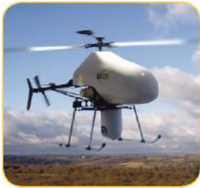
UAV Flight Control