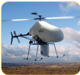
UAV Flight Control