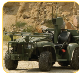
Land Vehicle Guidance

The NAV440 combines highly reliable MEMS sensors, magnetometers, and a WAAS/EGNOS-enabled GPS receiver all in a small and rugged environmentally sealed enclosure. The NAV440 provides consistent performance in challenging operating environments, and is user-configurable for a wide variety of applications.