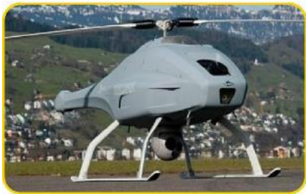
UAV Flight Control