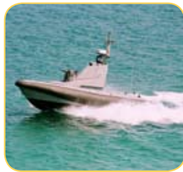
Unmanned Surface Vehicle