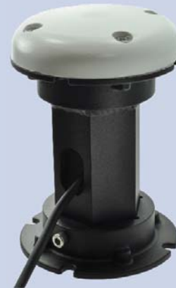
Antenna shown with optional bracket. Bracket allows for mounting on single center 5/8 bolt or four perimeter bolts.