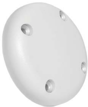
TRIMBLE AV33 GNSS ANTENNA

Small rugged package ideal for vehicle or man portable applications